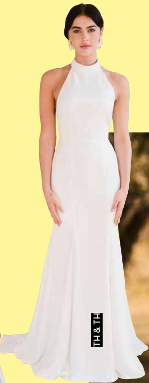
TH & TH